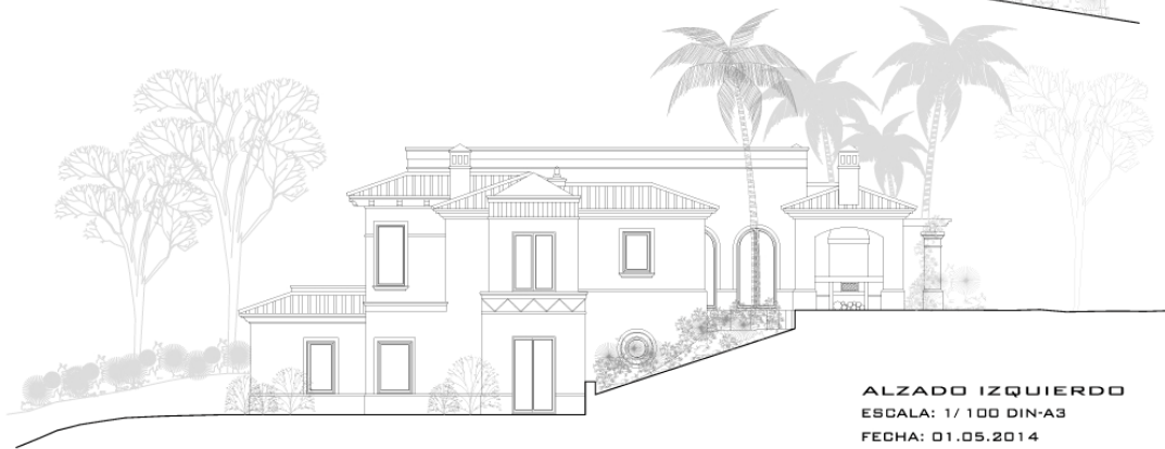
ALZADO IZQUIERDO ESCALA: 1/ 100 DIN-A3 FECHA: 01.05.2014